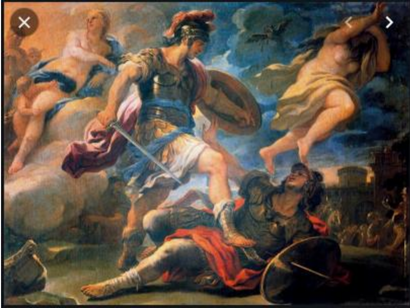
Virgil Aeneid Book XII