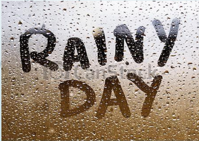
© Can Stock Photo - csp12649398